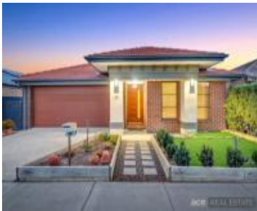
BOH REAL ESTATE

These are the three properties sold within two kilometres of the property for sale in the last six months that the estate agent or agents representative considers to be most comparable to the property for sale.