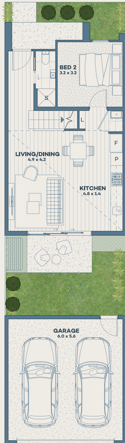
GROUND FLOOR PLAN LOT 1106, INDIGO WALK, LARA VIC 3212