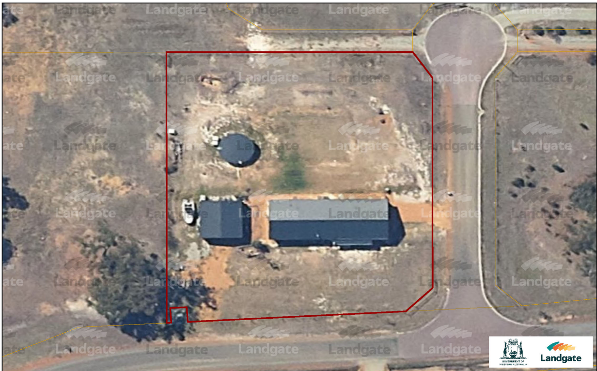
-- Map Viewer Plus --