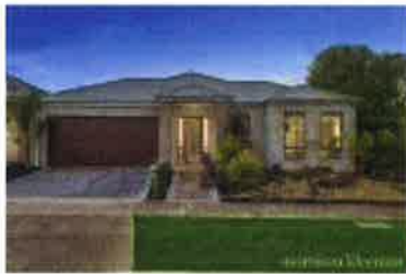
10 Sanctum Cirt DOREEN 3754 (REI)