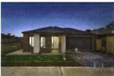
28 Fossilstone Av DOREEN 3754 (VG)

Price: $511,000 Method: Private Sale Date: 05/07/2017 Rooms: 5 Property Type: House (Res) Land Size: 375 sqm approx