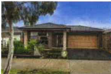
56 Orchard Rd DOREEN 3754 (REI/VG)

Price: $525,050 Method: Private Sale Date: 24/07/2017 Rooms: - Property Type: House (Res) Land Size: 399 sqm approx