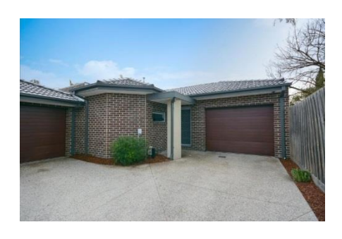
3/338 Melrose Drive, Tullamarine 3043 (REI/VG) 2 Bed 1 Bath 1 Car Price: $472,000 Method: Private Sale Date: 10/04/2019 Property Type: Villa Agent Comments: Modern brick villa unit with courtyard and lock up garage.