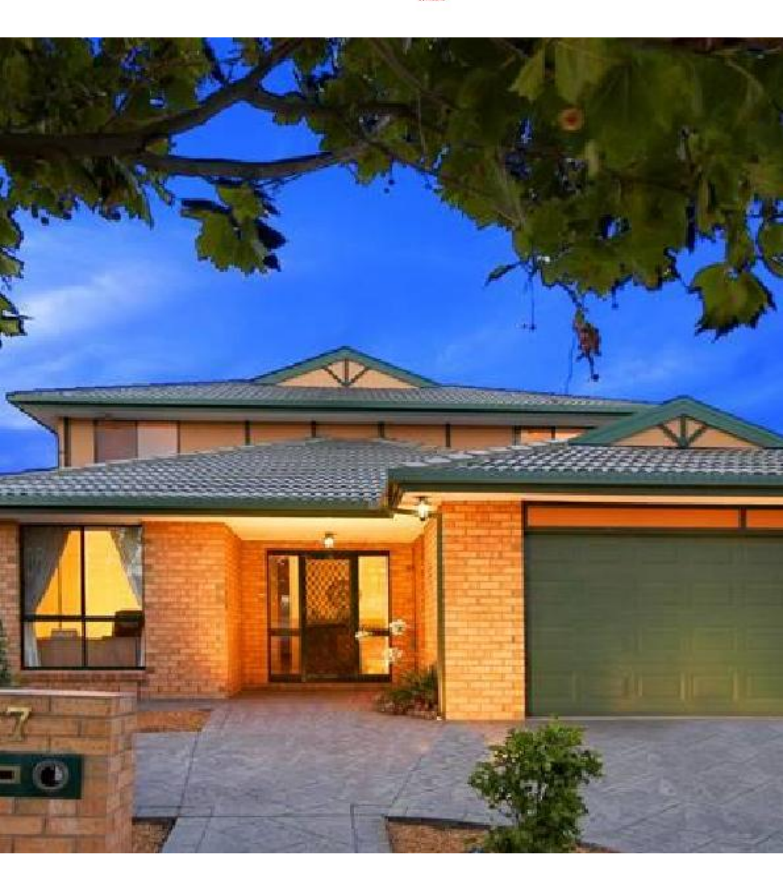
7 UPTON DRIVE, HILLSIDE, VIC 3037 PREPARED BY MITCH (HUNG) NGUYEN, PROFESSIONALS ST ALBANS