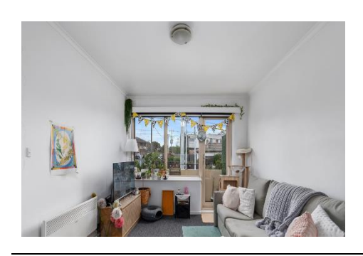
9/12 Allard Street, Brunswick West 3055 (REI) 1 Bed 1 Bath 1 Car Price: $310,000 Method: Private Sale Date: 08/08/2024 Property Type: Unit Agent Comments: Comparable location, Un-renovated property, Balcony, Comparable property