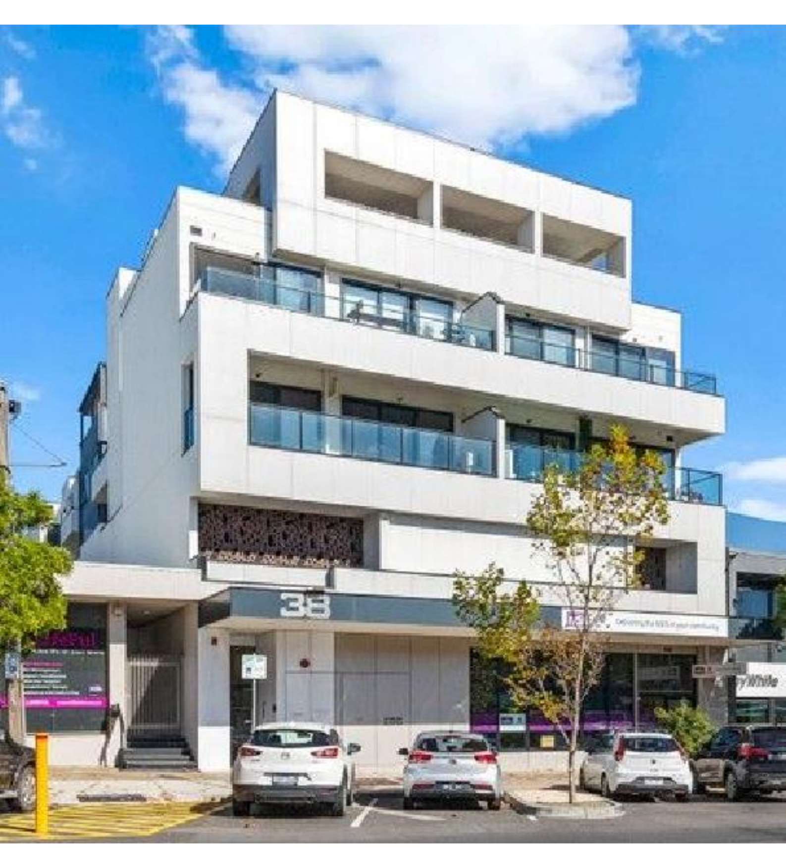
STATEMENT OF INFORMATION