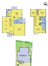
24 Redbark Hill Circuit, South Morang

Section 47AF of the Estate Agents Act 1980