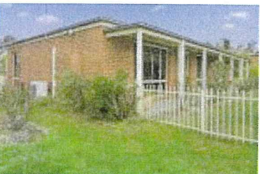
6 Emma Pl QUARRY HILL 3550 (REI/VG)

Price: $372,000 Method: Sale Date: 18/11/2019 Property Type: House (Res) Land Size: 800 sqm approx