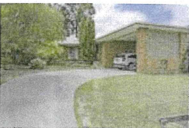
1 Biggs Ct FLORA HILL 3550 (VG)

Price: $377,000 Method: Private Sale Date: 13/12/2019 Rooms: 4 Property Type: House Land Size: 786 sqm approx