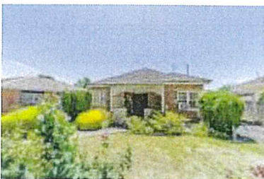
11 Nish St FLORA HILL 3550 (REI)