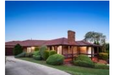
8 Bindi CI TEMPLESTOWE 3106 (REI/VG)