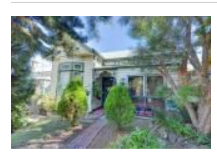
411 Nicholson St BLACK HILL 3350 (REI/VG)