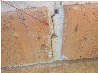
MINOR CRACK TO REAR WALL MORTAR