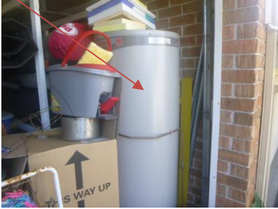
315 LITRE ELECTRIC WATER HEATER