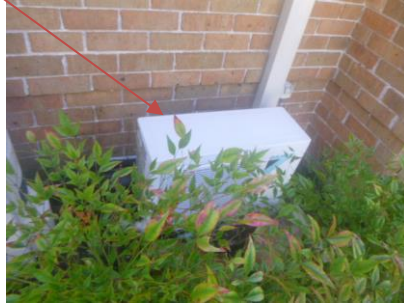
AIR CONDITIONER IN WORKING ORDER