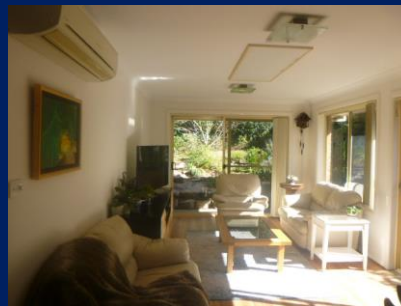
Photos of the Inspected Property

Please take the time to completely read this visual pre purchase building inspection report so you are able to make a fully informed decision prior to its purchase. (hjr007)