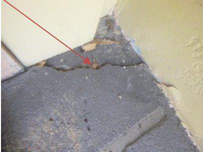
CRACKING TO REAR CONCRETE PATH