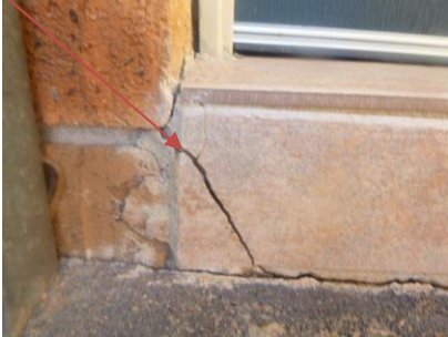
MINOR CRACKING TO RETAINER WALL