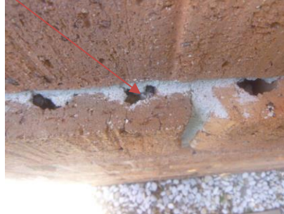
CORE HOLES NEED SEALING