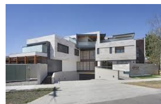
5/93 Truganini Road Carnegie VIC 3163 Sold Price: $630,000 Sold Date: 28 July 2018