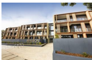
108/247 Neerim Road Carnegie VIC 3163 Sold Price: $689,000 Sold Date: 3 July 2018