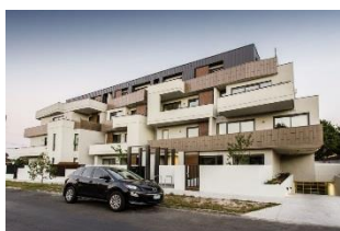
104/21 Belsize Avenue Carnegie VIC 3163 Sold Price: $628,000 Sold Date: 9 Aug 2018

These are three properties sold within two kilometres of the property for sale in the past six months that the estate agent or agents representative consider to be most comparable to the property for sale.