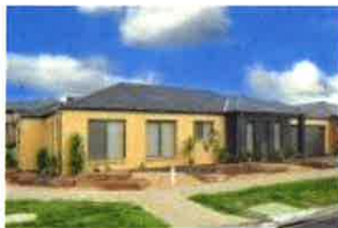
2 Bidgee Rise MERNDA 3754 (REI)