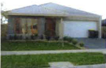
4 Lorenzo Way MERNDA 3754 (VG)

Price: $480,000 Method: Sold Before Auction Date: 25/03/2017 Rooms: - Property Type: House (Res) Land Size: 330 sqm