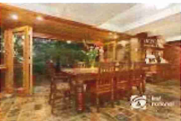
1 Elizabeth Ct EMERALD 3782 (REI/VG)

Price: $775,000 Method: Private Sale Date: 14/05/2018 Rooms: 6 Property Type: House Land Size: 2023 sqm approx