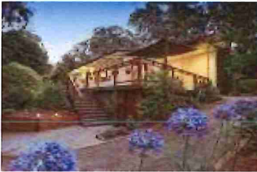
18 Lakeside Dr EMERALD 3782