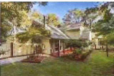
35 Majestic Dr EMERALD 3782 (REI)

Price: $820,000 Method: Private Sale Date: 27/02/2018 Rooms: 6 Property Type: House Land Size: 2064 sqm approx