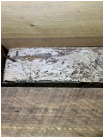
Some evidence of previous borer activity