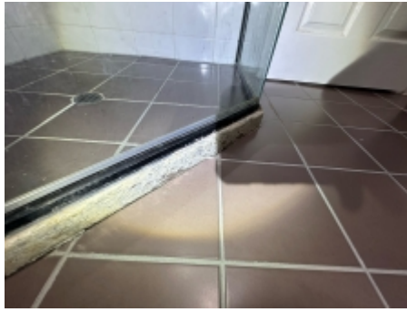
Oxidation of shower stall angle.