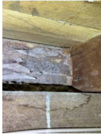
Some evidence of previous borer activity