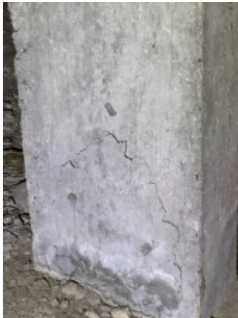
A couple of columns show signs of early development of cracking