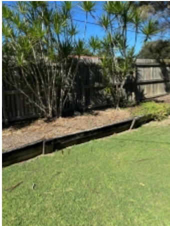
Front garden retaining wall requires repair