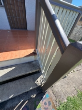
Preventative maintenance required to front veranda saddle.