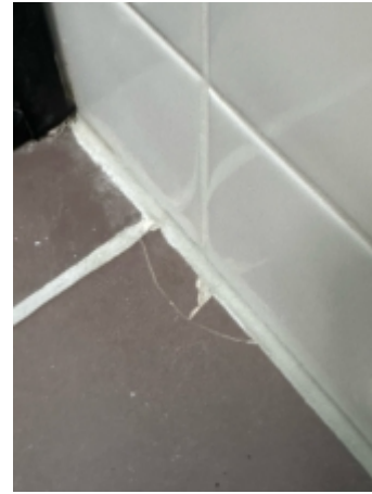
Small crack in shower stall floor tile