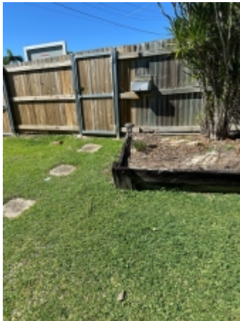
Front garden retaining wall requires repair