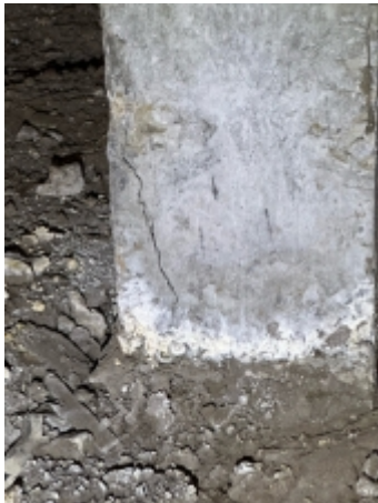
A couple of columns show signs of early development of cracking