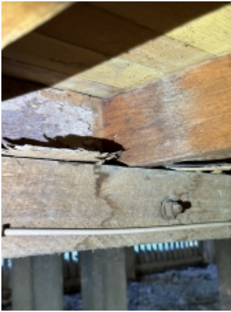
Some evidence of previous borer activity