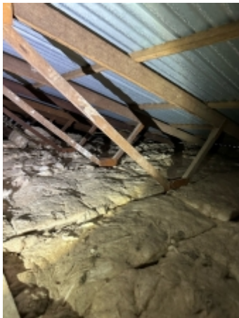
Roof space photos