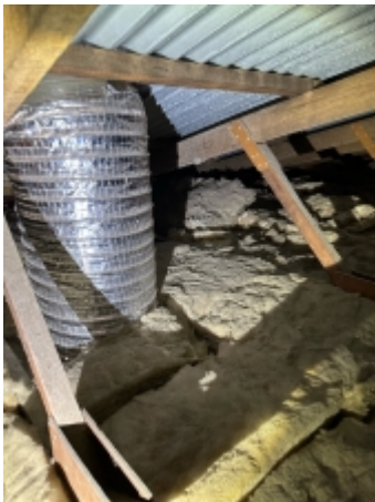
Roof space photos