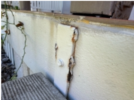
Preventative maintenance required to steel string