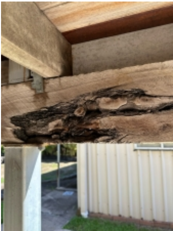
Knot in bearer of rear timber deck