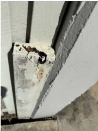
Moisture damage to some timber battening materials