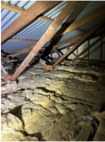
Roof space photos

This document certifies that the property described in this Report has been inspected by the Building Consultant & Timber Pest Detection Consultant in accordance with the level of service requested by the Client and the Terms and Conditions set out in this Report, and in accordance with the current edition of the Report Systems Australia (RSA) Handbooks Standard Property Inspection Reports 'Uniform Inspection Guidelines for Building Consultants' & Timber Pest Detection Reports 'Uniform Inspection Guidelines for Timber Pest Detection Consultants'.