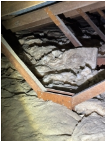
Roof space photos