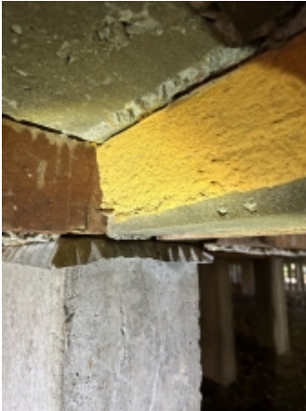
Some evidence of previous borer activity

The Consultant sought evidence of noticeable building deficiencies or environmental factors that may contribute to the presence of timber pests. In respect of moisture management issues, the inspection included the potential for or presence of water or dampness in unintended locations.