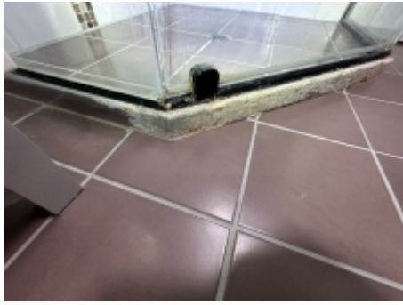
Oxidation of shower stall angle.