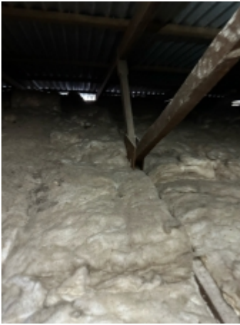
Roof space photos