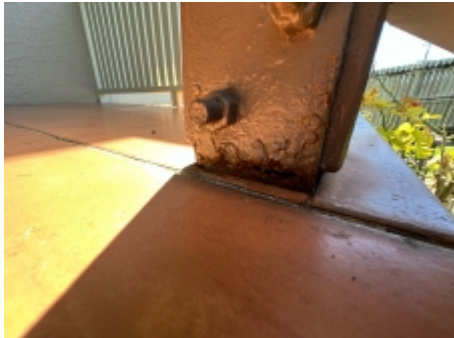
Preventative maintenance required to front veranda saddle.