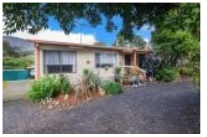
Image: 3Image: 1Image: 3Price: $341,000Method: Private SaleDate: 21/07/2017Rooms: 4Property Type: HouseLand Size: 663 sqm approx