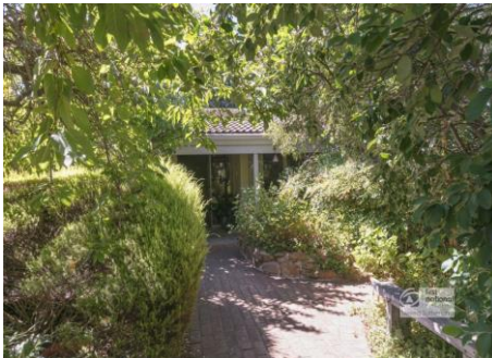
Kennington 52 Mill Street