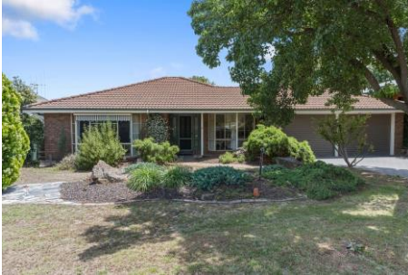
Kennington 9 Heyington Place