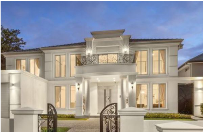
26 Thomas St Camberwell 3124 5 bed, 4 bath, 2 cars