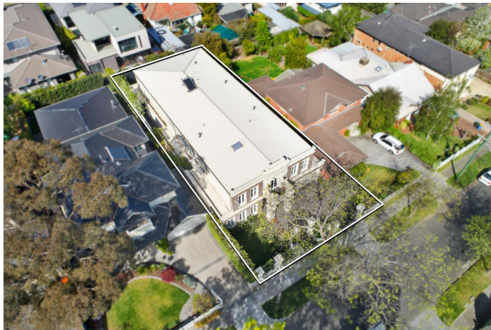
8 Webster St Camberwell 5 bed, 5 bath, 2 cars