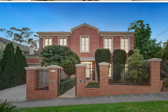
165 Watter Valley Rd Camberwell 4 bed, 2 bath, 2 cars