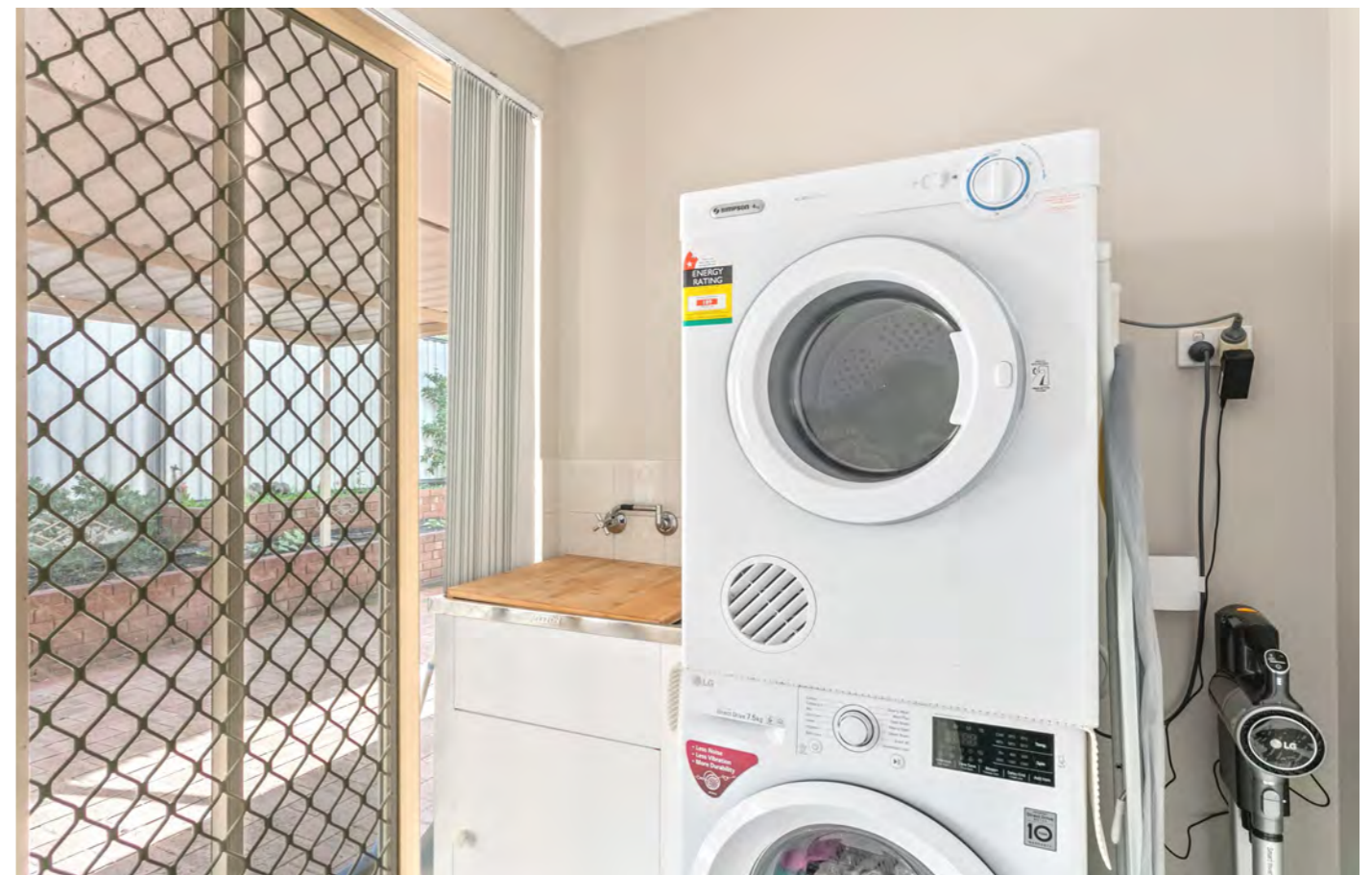
2/11 Goddard Street Lathlain