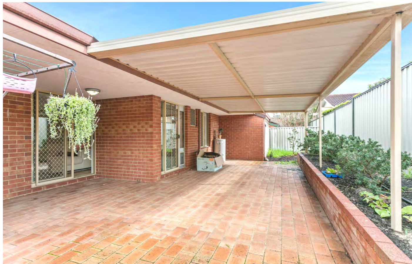
2/11 Goddard Street Lathlain