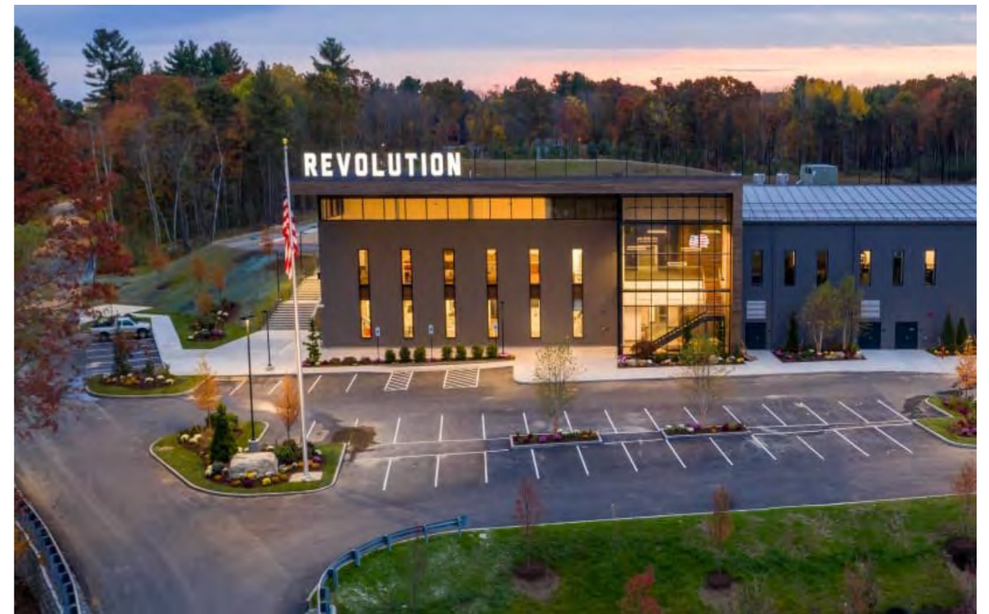
2/11 Goddard Street Lathlain