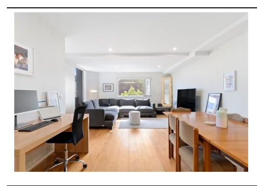
101/8 Burrowes Street, Ascot Vale 3032 (REI/VG) 1 Bed 1 Bath 1 Car Price: $385,000 Method: Private Sale Date: 09/11/2023 Property Type: Apartment Agent Comments: One bedroom apartment located nearby. Inferior balcony size