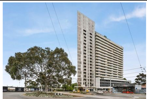
1116/1 Ascot Vale Road, Flemington 3031 (REI) 1 Bed 1 Bath 1 Car Price: $385,000 Method: Private Sale Date: 01/11/2023 Property Type: Apartment Agent Comments: One bedroom apartment with superior view of Flemington racecourse. Inferior balcony size.