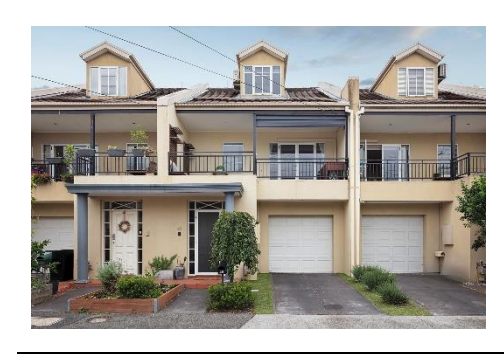
46 Yambla Street, Clifton Hill 3068 (REI) 3 Bed, 2 Bath, 1 Car Price: $$1,525,000 Method: Auction Sale Date: 02/03/2024 Property Type: House Agent Comments: Same location, inferior size and outside space, superior quality