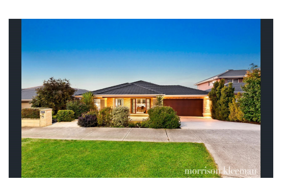
High Spec home with stunning views.

Indicative Selling Price $750,000 - $770,000 Median House Price March quarter 2017: $572,500