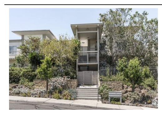
6/1 Horizon Drive, Maribyrnong 3032 (REI) 3 Bed 2 Bath 2 Car Price: $645,000 Method: Private Sale Date: 12/07/2024 Property Type: Apartment Agent Comments: Comparable 3 bedroom accommodation in neighbouring building.