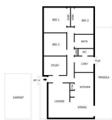
10 Ryong Street, Grovedale

Section 47AF of the Estate Agents Act 1980