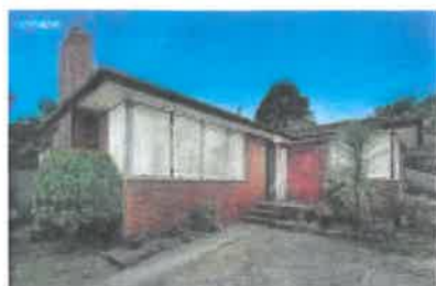
3 Albert Ct FRANKSTON 3199 (REI)

Price: $495,000 Method: Private Sale Date: 17/03/2017 Rooms: - Property Type: House Land Size: 537 sqm