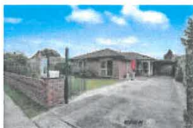
30 Frank St FRANKSTON 3199