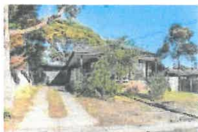
15 Lipton Dr FRANKSTON 3199 (REI/VG)

Price: $510,000 Method: Auction Sale Date: 06/05/2017 Rooms: - Property Type: House (Res) Land Size: 535 sqm