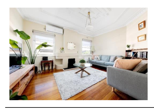
8/8 St Georges Grove, Parkville 3052 (REI) 2 Bed 1 Bath 1 Car Price: $768,000 Method: Sold Before Auction Date: 13/05/2024 Property Type: Unit Agent Comments: Same development, comparable attributes and features, similar condition