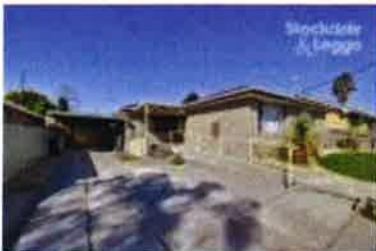
16 Cherry Cr MORWELL 3840 (REI/VG)

Price: $222,000 Method: Private Sale Date: 31/01/2018 Rooms: - Property Type: House Land Size: 580 sqm approx