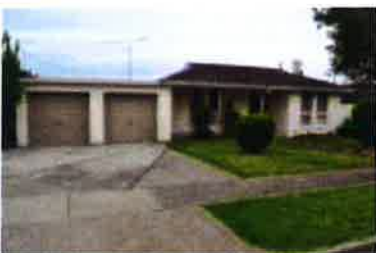
1 Peter St MORWELL 3840 (VG)

Price: $205,000 Method: Private Sale Date: 25/09/2017 Rooms: 4 Property Type: House (Res) Land Size: 656 sqm approx