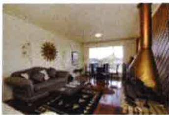
33 Kurt St MORWELL 3840 (REI/VG)