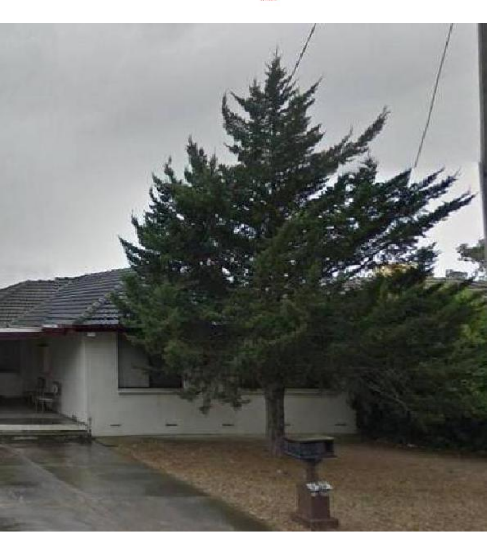
157 STATION ROAD, DEER PARK, VIC 3023 PREPARED BY MITCH (HUNG) NGUYEN, PROFESSIONALS ST ALBANS