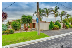
8 Hayden Street Hoppers Crossing VIC 3029