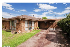
7 Smeaton Avenue Hoppers Crossing VIC 3029

These are the 3 properties sold within 2 kilometres of the property for sale in the last 6 months that the estate agent or agent's representative considers to be most comparable to the property for sale.