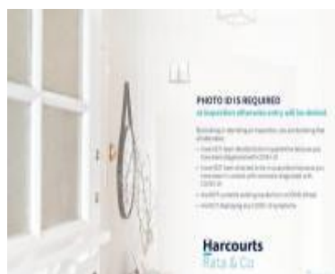
PHOTO ID IS REQUIRED at inspection otherwise entry will be denied. By booking or attending an inspection, you are declaring that all attendees: • Have NOT been directed to be in quarantine because you have been diagnosed with COVID-19 • Have NOT been directed to be in quarantine because you have been in contact with someone diagnosed with COVID-19 • Are NOT currently waiting results from a COVID-19 test • Are NOT displaying any COVID-19 symptoms

These are the three properties sold within two kilometres of the property for sale in the last six months that the estate agent or agent's representative considers to be most comparable to the property for sale.