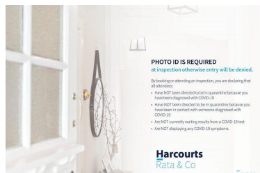
PHOTO ID IS REQUIRED at inspection otherwise entry will be denied. By booking or attending an inspection, you are declaring that all attendees: • Have NOT been directed to be in quarantine because you have been diagnosed with COVID-19 • Have NOT been directed to be in quarantine because you have been in contact with someone diagnosed with COVID-19 • Are NOT currently waiting results from a COVID-19 test • Are NOT displaying any COVID-19 symptoms

Section 47AF of the Estate Agents Act 1980